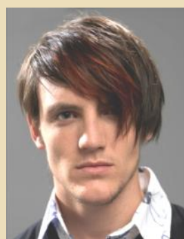
Unacceptable Covered face