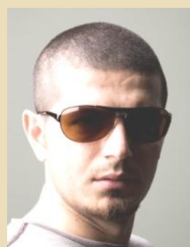
Unacceptable Sunglasses, shadow